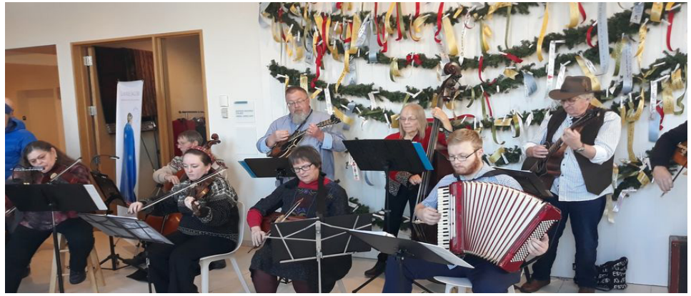
Members of the Nya Duvemåla Folkmusiklag musical group performing during a Swedish festival